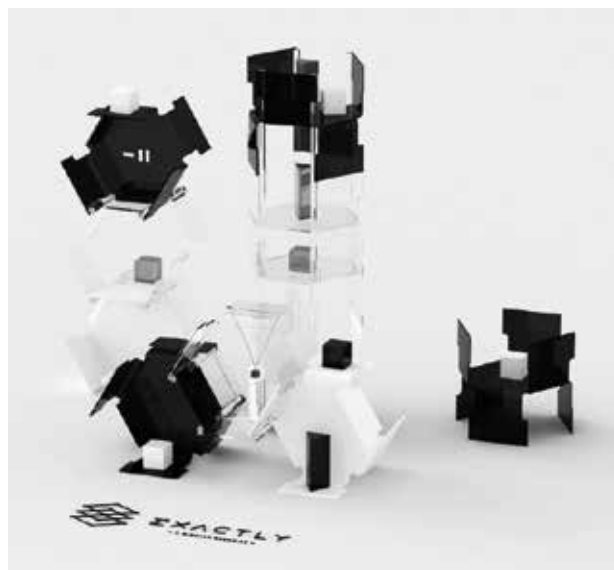
Project: Studio Creativo Menopausa – II